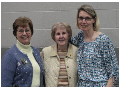
Meet Our Women of the Year, p6