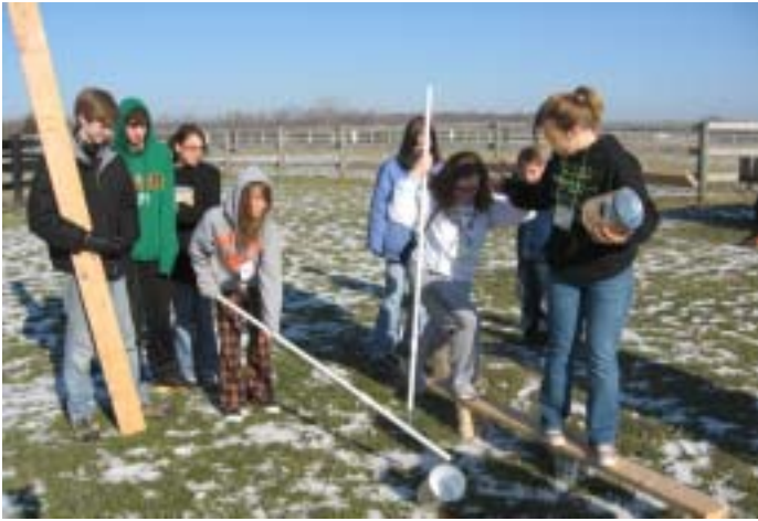
High school Winter Retreat participants use boards, poles and coffee cans as they attempt to cross the 'Chemical Stream' - one of the team challenge and community building activities held Saturday morning.

Youth take a break from skiing to relax and warm up in the lodge at Perfect North Slopes at the annual Youth Ministry/Boy Scout ski trip.