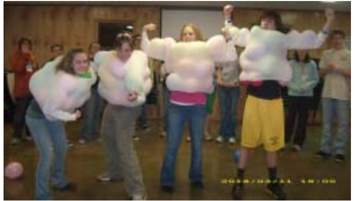
Teens show off their balloon muscles after playing 'Muscle Mania' ice breaker at the high school Winter Retreat held in February.

Youth take a break from skiing to relax and warm up in the lodge at Perfect North Slopes at the annual Youth Ministry/Boy Scout ski trip.