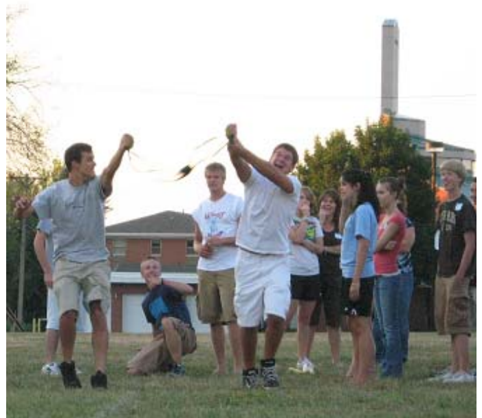
launching the year with water balloons